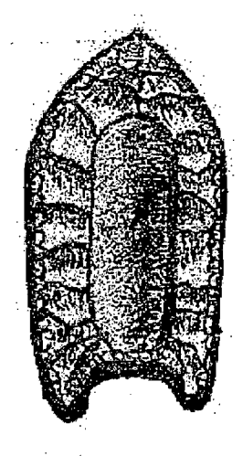
Typical Folsom point

-- and the Very Latest The Center Online